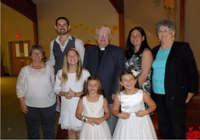
Thanks to Emma Crowley for Photo process